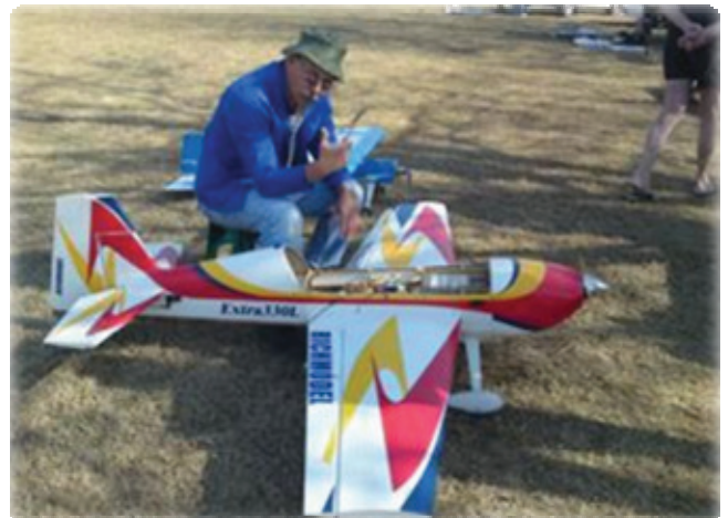
Not all operations need a theater