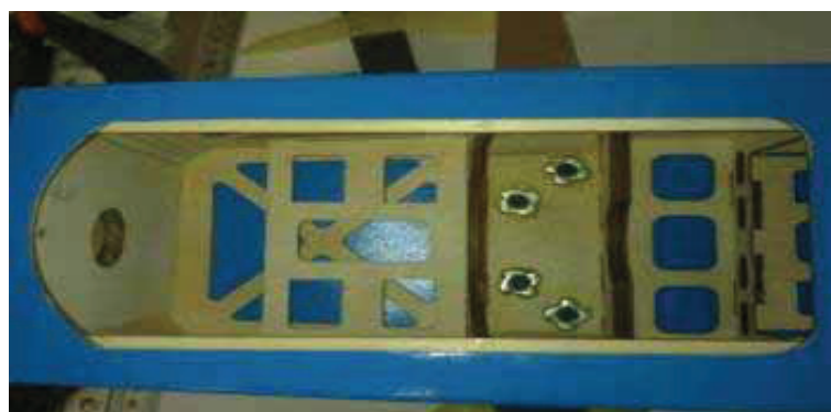
Pre-installed Hatch - for easy access

Thanks to Barry "the man with a Large soldering iron" that kindly fitted all the electric fittings and plugs to the motor and battery it was one job less for us to do.