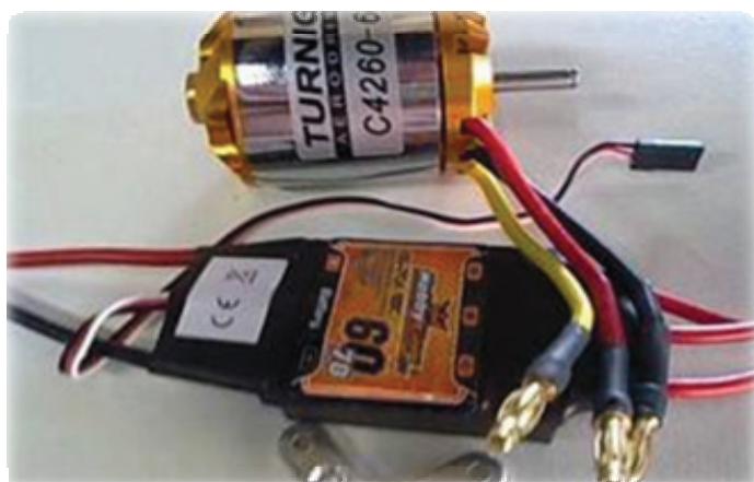
Turnigy C4260-600 & 60 Amp Speed Controller

Tip: - Keep a large bottle of solvent handy to wipe off all the epoxy finger prints from the kit.