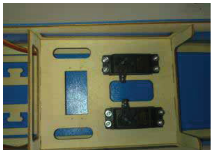
Hextronix HX5010 Twin Bearing Servo's

Having glued the wings together and fitted the Horizontal & Vertical tail it was time for well-deserved break, the epoxy needed to set